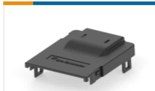
TE Part #1986186-1 Strain Relief,20 Posn,D3000 Dynamic, 2