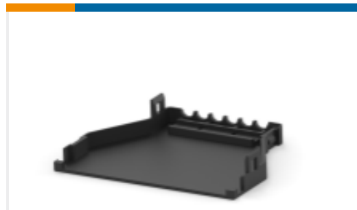
TE Part #1776695-1 Strain Relief, D5200, Dynamic