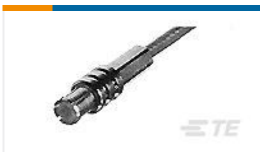
TE Part #1060875-2 MCX CABLE PLUG, CRIMP ATTACH