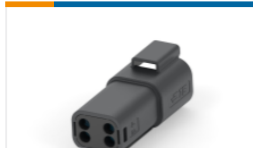
TE Part #1-2600030-0 4CCT BLACK RECEPT W/LARGE SEAL