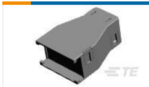
TE Part #1986185-1 Strain Relief,6 Posn,D5200 Dynamic, 2