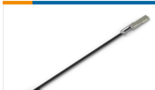
TE Part #2333393-7 QSFP 25GIG 30AWG 3 METER