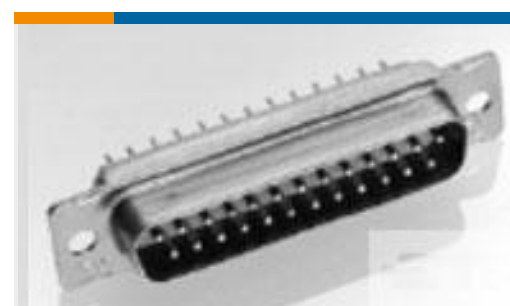
TE Part #205561-2 RECEPT ASSY,37 POSN,AMPLIMITE