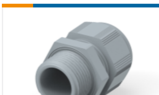
TE Part #1SNG601170R0000 EP-SG-NPT34-GR-A