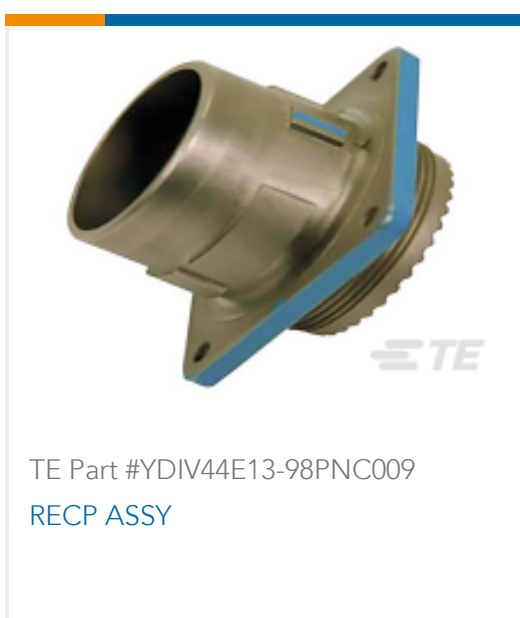
TE Part #YDIV44E13-98PNC009 RECP ASSY