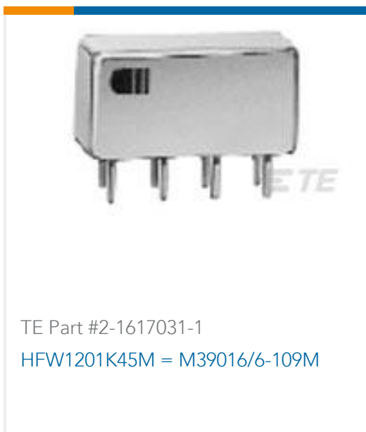
TE Part #2-1617031-1 HFW1201K45M = M39016/6-109M