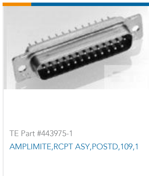
TE Part #443975-1 AMPLIMITE,RCPT ASY,POSTD,109,1