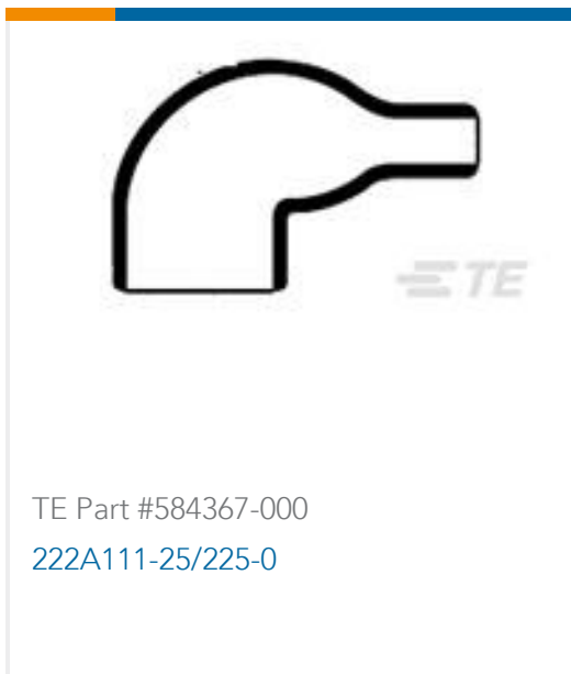
TE Part #584367-000 222A111-25/225-0