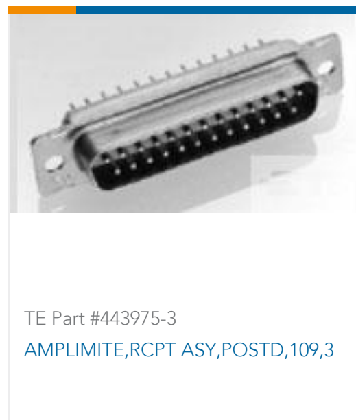
TE Part #443975-3 AMPLIMITE,RCPT ASY,POSTD,109,3