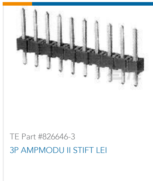
TE Part #826646-3 3P AMPMODU II STIFT LEI