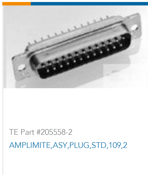
TE Part #205558-2 AMPLIMITE,ASY,PLUG,STD,109,2