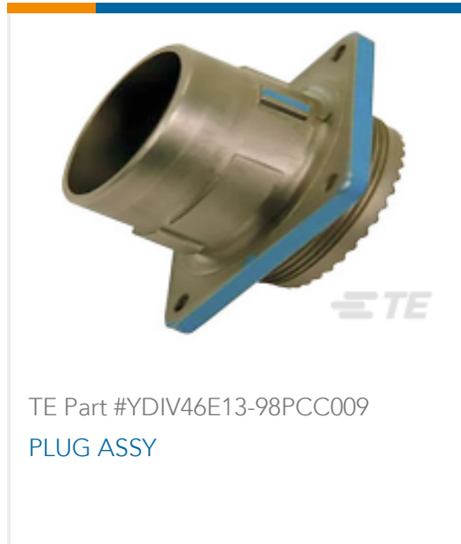
TE Part #YDIV46E13-98PCC009 PLUG ASSY