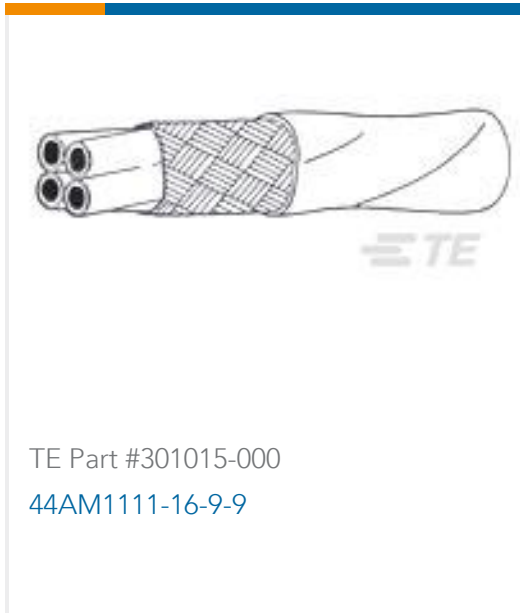
TE Part #301015-000 44AM1111-16-9-9