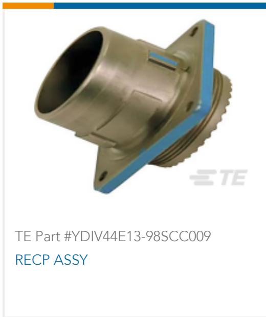
TE Part #YDIV44E13-98SCC009 RECP ASSY