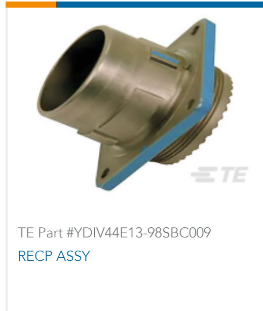
TE Part #YDIV44E13-98SBC009 RECP ASSY