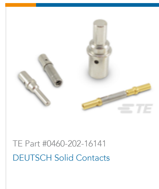
TE Part #0460-202-16141 DEUTSCH Solid Contacts