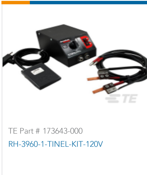
TE Part # 173643-000 RH-3960-1-TINEL-KIT-120V