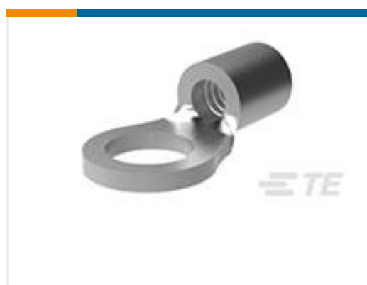
TE Part #34104-6 SOLIS R 22-16 4 NIPL