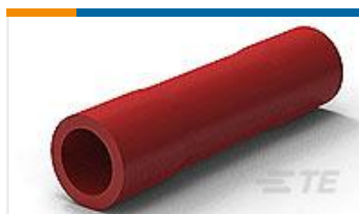
TE Part #34131 SPLICE,PG PARA 22-16