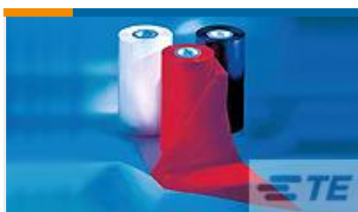
TE Part #754073-000 TMS-RJS-RIBBON-4HT