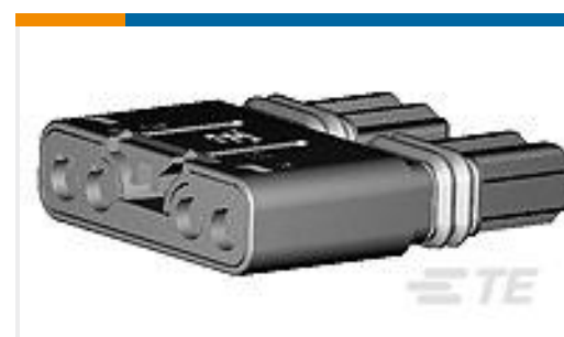
TE Part #2106135-4 Assembly, Free Hanging Plug, SLC, 4 pos