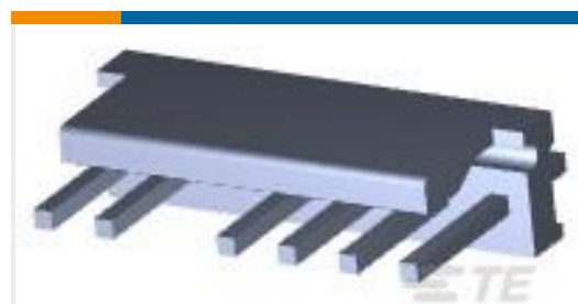
TE Part #643464-3 07P MTA156 HDR ASSY STR W/O#5