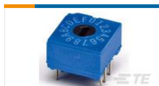
TE Part #1825007-1 DRD10CE04=ROT DIP,10P