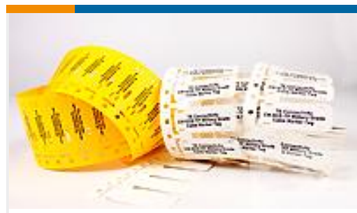
TE Part #E55556-000 HTCM-SCE-TP-1/2-4H-4