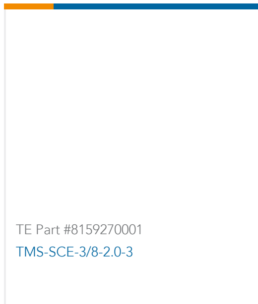
TE Part #8159270001 TMS-SCE-3/8-2.0-3