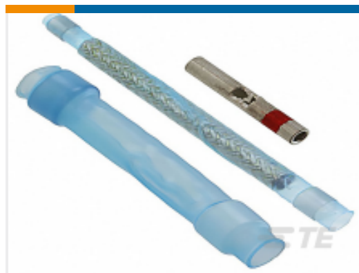
TE Part #EG3678-000 D-200-0233-RT