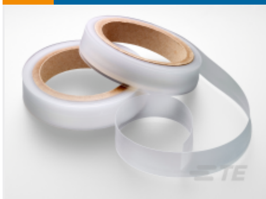
TE Part #EG8290-000 S1260-TAPE-3/4INX25FT-CL