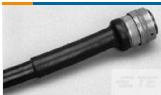
TE Part #9264634014 ATUM-12/4-X-SP