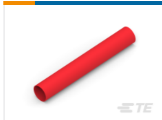
TE Part #NB14922001 DWP-125-3/4-2-STK