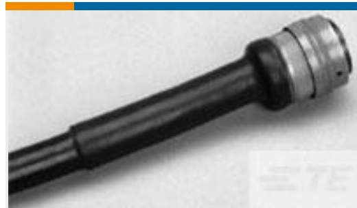
TE Part #3000814006 ATUM-6/2-X-SP