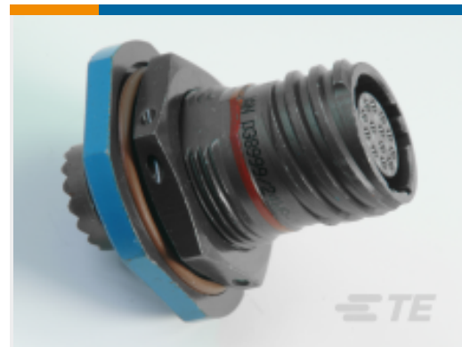
TE Part #ZPF000000000110465 DTS 24 S 17-06 PN-A1442