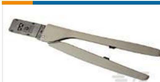
TE Part #1901611-1 CCII PIDG STRATO 24-20 ASSY