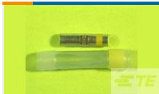
TE Part #650126-000 D-436-82