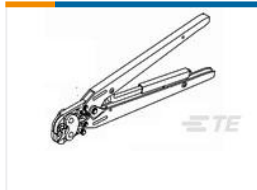
TE Part #46121 DAHT PG PIDG 26-22 ASSY