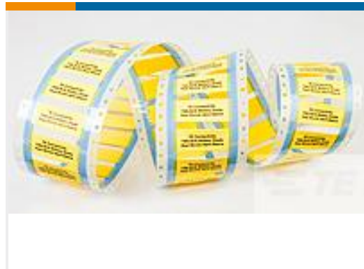
TE Part #330433-000 TMS-SCE-2X-1K-3/16-9