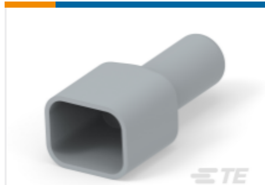
TE Part #DT8P-BT BOOT, 8P, REC, ST, GRY