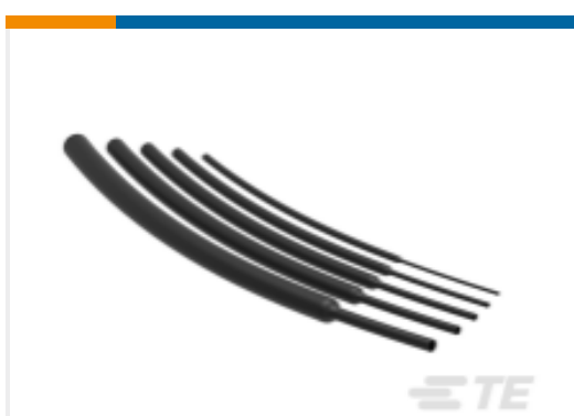
TE Part #NB14474001 VERSAFIT-3/8-0-FSP