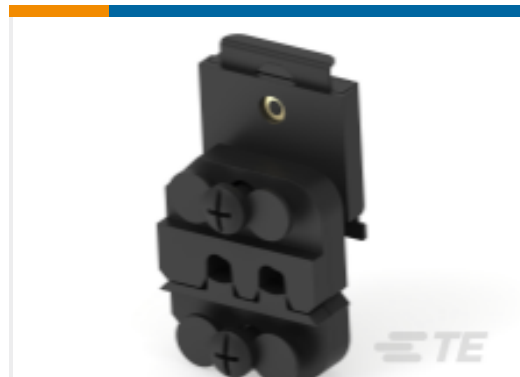
TE Part #2063575-2 SDE MCON1.2 14-18AWG DIE SET