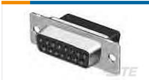
TE Part #205209-7 RECP ASSY SIZE 4