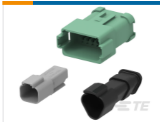
TE Part #DT04-08PA-C015 DEUTSCH DT Receptacle Connectors