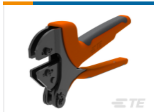
TE Part #2362810-1 SDE CRIMP HAND TOOL FRAME W /O DIES