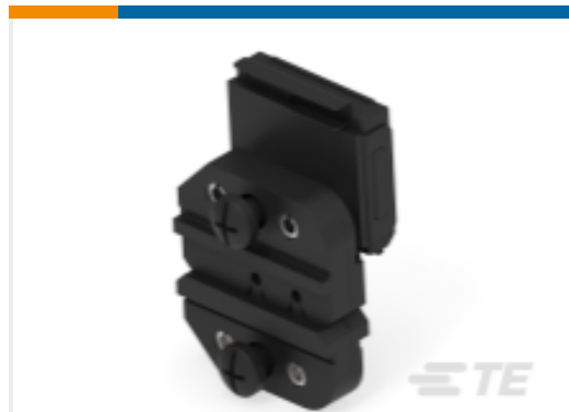
TE Part #2063570-2 SDE F MCON1.2 0.50-0.75mm2 DIE SET