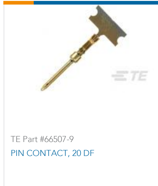
TE Part #66507-9 PIN CONTACT, 20 DF