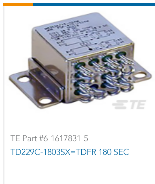
TE Part #6-1617831-5 TD229C-1803SX=TD FR 180 SEC