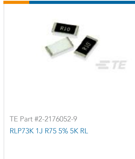
TE Part #2-2176052-9 RLP73K 1J R75 5% 5K RL