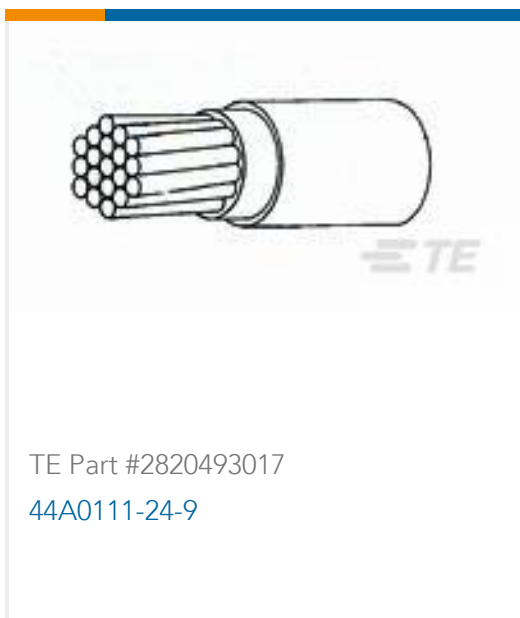
TE Part #2820493017 44A0111-24-9