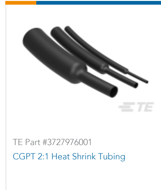
TE Part #3727976001 CGPT 2:1 Heat Shrink Tubing