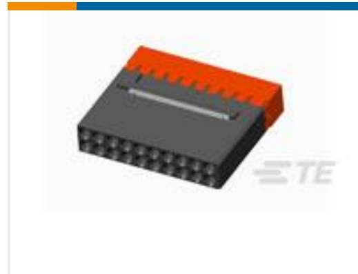
TE Part #258215-000 MTCP-122-20S1