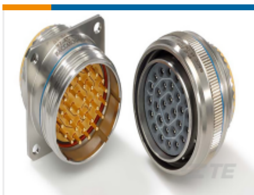
TE Part #ZPF0000000000007358 983-0S 12-12 PN