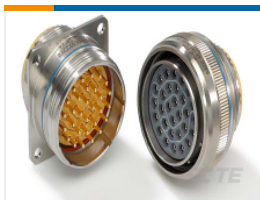
TE Part #ZPF0000000000008198 983-6KE 10-05 S6 L