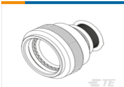
TE Part #953753-000 TXR40BW00-1206AI