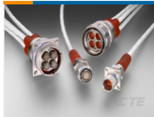
TE Part #YCFX26W1108PZB0000 PLUG ASSY