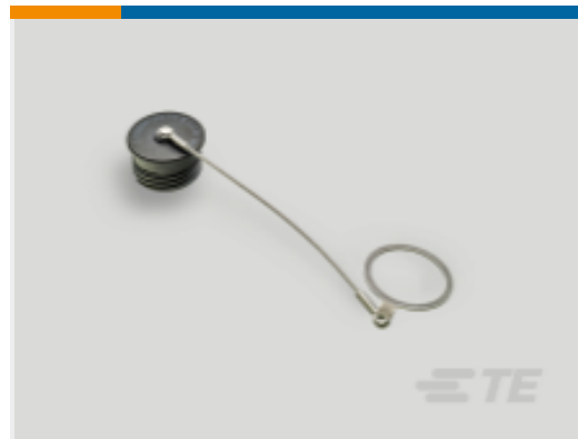
TE Part #YDTS32Z21RV0010000 CAP ASSEMBLY