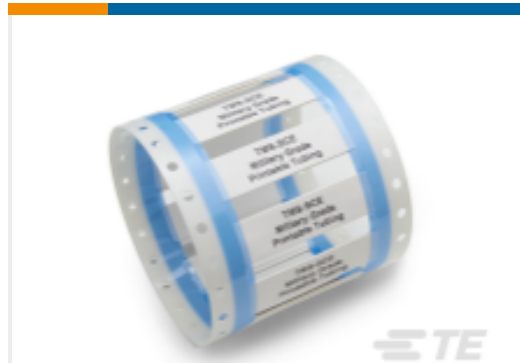
TE Part #5061850001 TMS-SCE Military Grade Sleeves