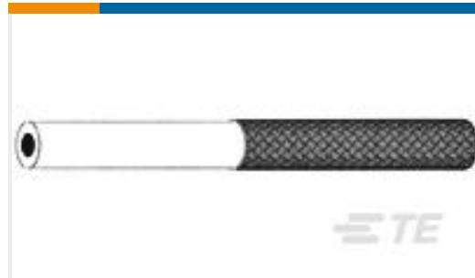
TE Part #A165103001 RAY-101-7.5(100)