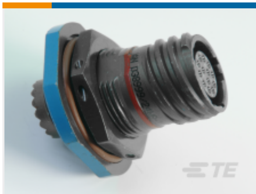
TE Part #YDTS24F11-35SNV001 RECP ASSY