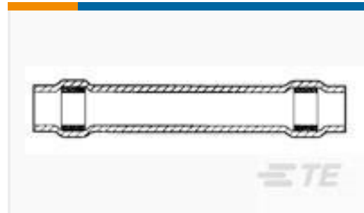
TE Part #A36675-000 D-200-83