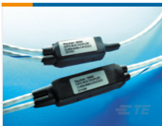
TE Part #182317-000 D-500-0255-059