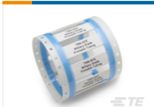
TE Part #9422810001 TMS-SCE Military Grade Sleeves