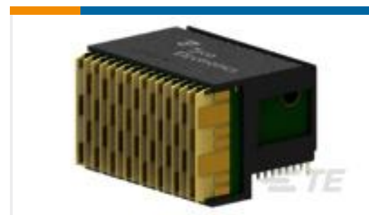
TE Part #1410187-3 MULTIGIG RT T2 7RW DC DF CT