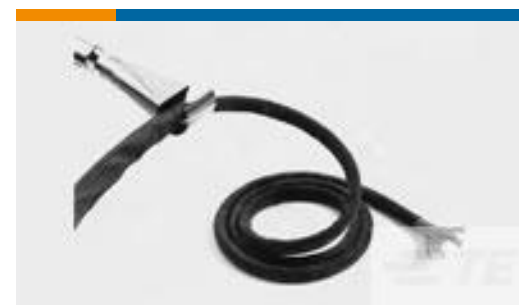
TE Part #CB7764-000 RW-200-1/8-0-SP