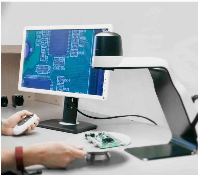
* Monitor not included

Ethernet connection enables simultaneous screen sharing using IP address.