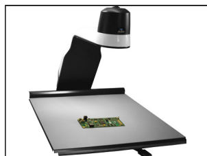
TEK-XY Inspection table Precision x-y gliding stage ESD SAFE

TEK-SCOPE PLUS accessories offer added convenience. For more information visit ideal-tek.com