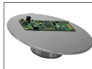
TEK-TILT-PLUS 360° Inspection table and 4D lens Inspection from any angle ESD SAFE

For detailed information, read the complete user manual