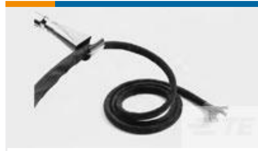
TE Part #CB03434010 RW-200-E-1-0-SP