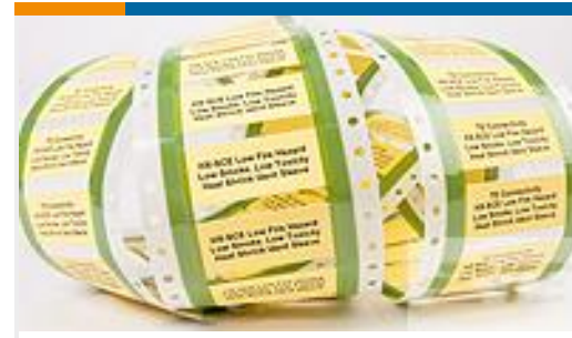
TE Part #F93116-000 HX-SCE-2.5K-6.4-50-S1-4