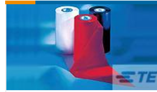
TE Part #F55931-000 1966-RIBBON