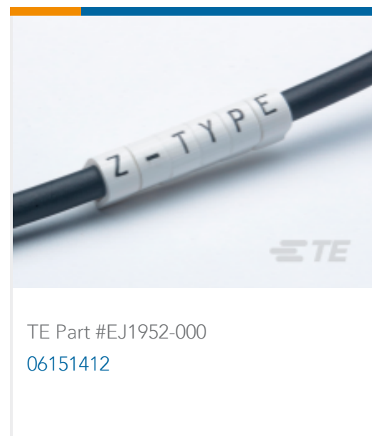
TE Part #EJ1952-000 06151412