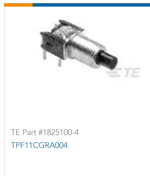
TE Part #1825100-4 TPF11CGRA004