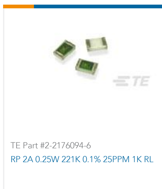
TE Part #2-2176094-6 RP 2A 0.25W 221K 0.1% 25PPM 1K RL