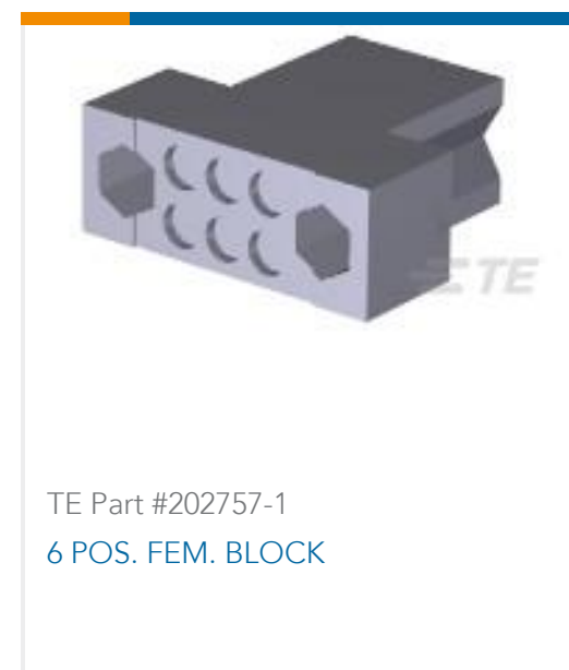
TE Part #202757-1 6 POS. FEM. BLOCK