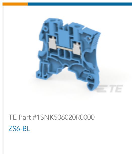
TE Part #1SNK506020R0000 ZS6-BL