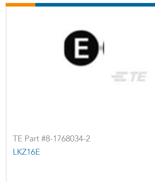
TE Part #8-1768034-2 LKZ16E