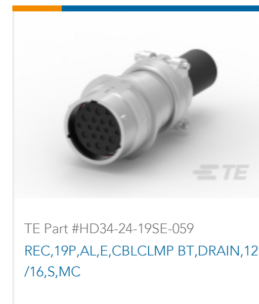
TE Part #HD34-24-19SE-059 REC,19P,AL,E,CBLCLMP BT,DRAIN,12/16,S,MC