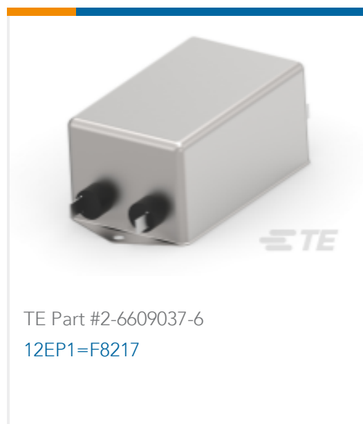
TE Part #2-6609037-6 12EP1=F8217