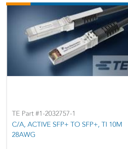
TE Part #1-2032757-1 C/A, ACTIVE SFP+ TO SFP+, TI 10M 28AWG