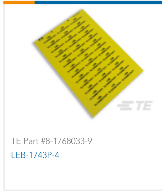
TE Part #8-1768033-9 LEB-1743P-4