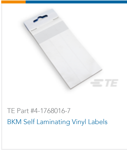
TE Part #4-1768016-7 BKM Self Laminating Vinyl Labels