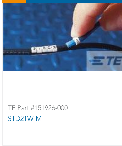
TE Part #151926-000 STD21W-M