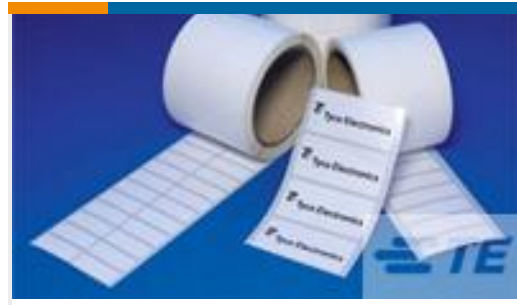
TE Part #9-1768017-9 EET-0825P-9