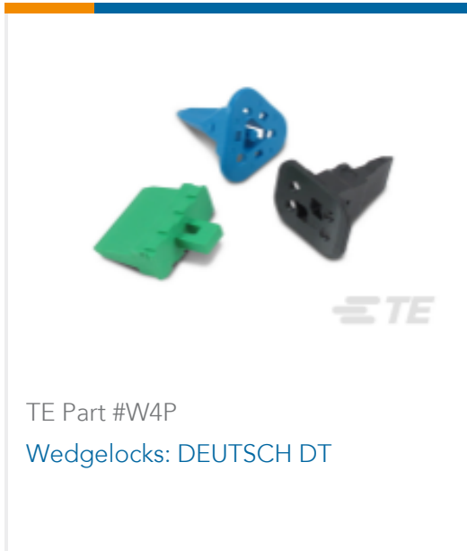
TE Part #W4P Wedgelocks: DEUTSCH DT