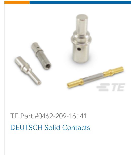
TE Part #0462-209-16141 DEUTSCH Solid Contacts