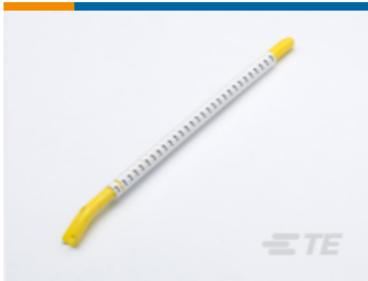
TE Part #4-1768045-0 STD Snap-On Markers