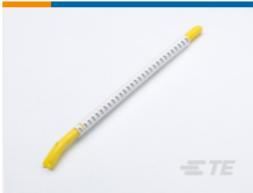
TE Part #8-1768045-2 STD Snap-On Markers