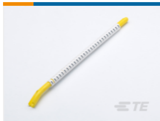
TE Part #403072-000 STD Snap-On Markers