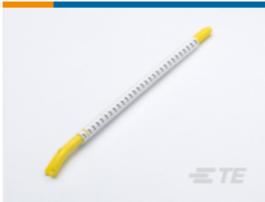
TE Part #982978-000 STD Snap-On Markers