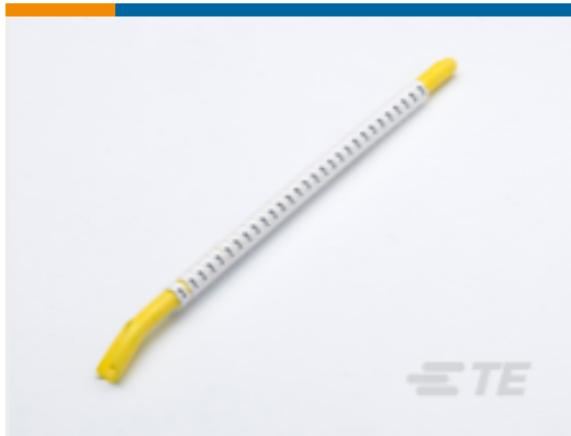
TE Part #8-1768045-0 STD Snap-On Markers