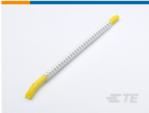
TE Part #9-1768044-3 STD Snap-On Markers