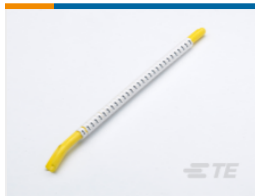
TE Part #2-1768045-3 STD Snap-On Markers