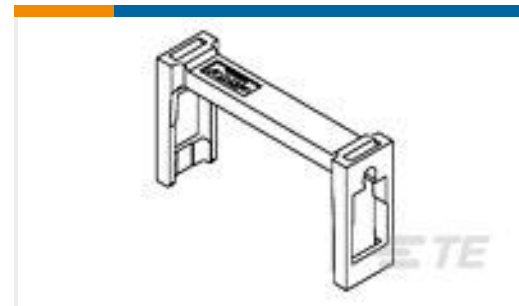
TE Part #1-100103-0 10P.A/L.STRAIN REL.