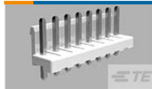
TE Part #1-1123723-7 3.96 EP HDR ASSY 7P(NATURAL)