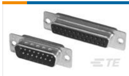
TE Part #4-1393483-7 V42254A1115C209=SUB D STIFTLI