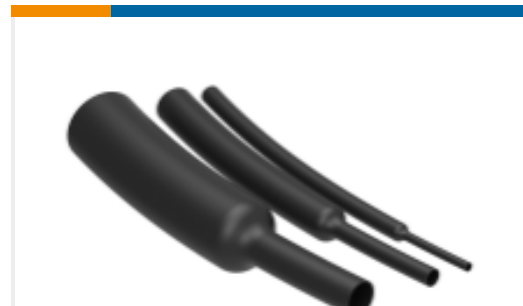
TE Part #5069806046 CGPT-1.6/0.8-0-90MM