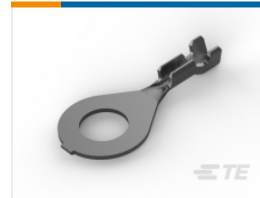
TE Part #964197-1 AM RINGZUNGE MIF