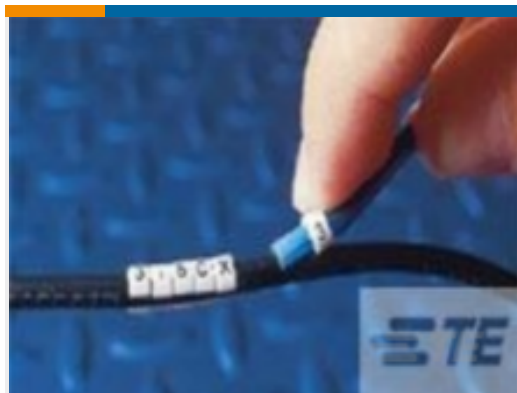
TE Part # 007980-000 STD09Y-7