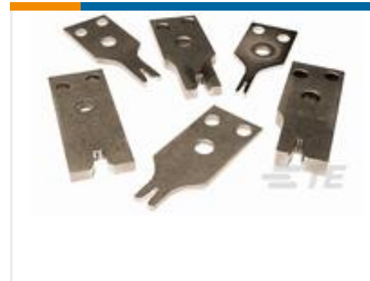
TE Part #1752766-1 CRIMPER, INSULATION,SP(.072)