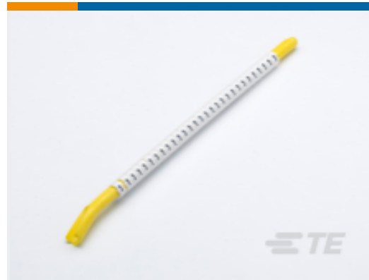
TE Part #2-1768045-3 STD Snap-On Markers