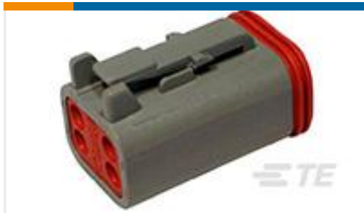
TE Part #DT06-4S PLG, 4P, GRY, N