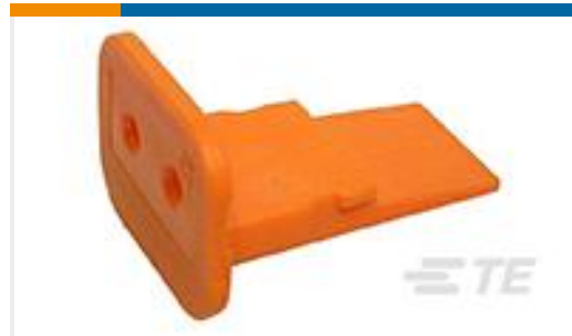
TE Part #W2S WEDGE LOCK, 2P, PLG, ORG, STD, DT