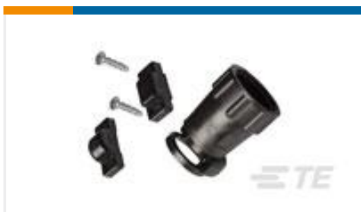
TE Part #206966-7 CABLE SHELL CLAMP SIZE 13