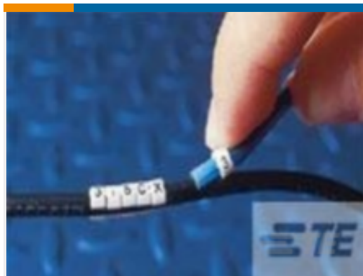
TE Part # 001308-000 STD06Y-L