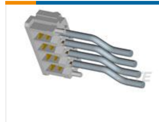
TE Part #6-173977-4 CT MT REC ASSY 4P BLACK