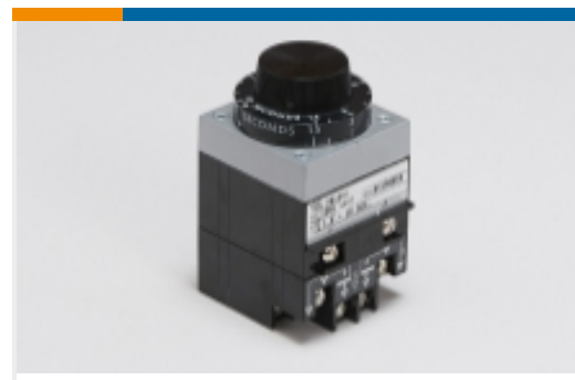
Time Delay Relays(176)