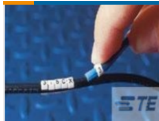
TE Part #610528-000 STD03Y-2