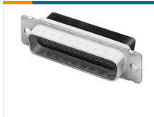
TE Part #748364-1 15 HD22 CRIMP SNAP PLUG