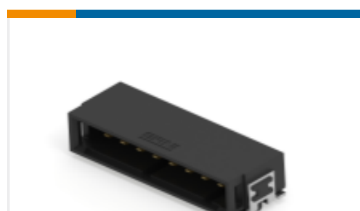
TE Part #284121-E SRCA 2,54 8 M 1 SMD 137 E1 094 * GURT *