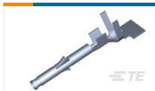
TE Part #171639-1 MINI U-M-N-L SOCKET L.P