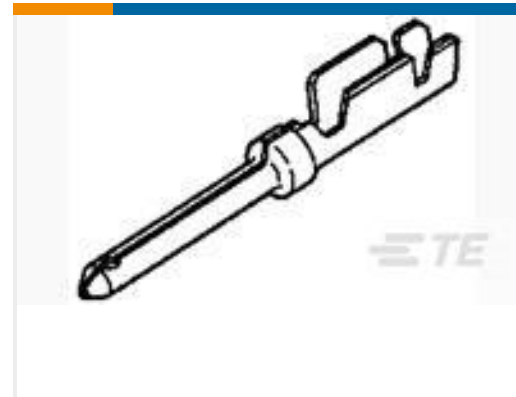
TE Part #1658670-2 PIN CONTACT, 22-28 AWG, 22 DF, AMPLIMITE