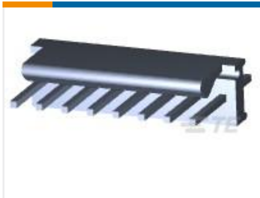
TE Part #640456-8 08P MTA100 HDR ASSY F/L SQ STR