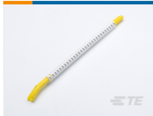
TE Part #700690-000 STD Snap-On Markers