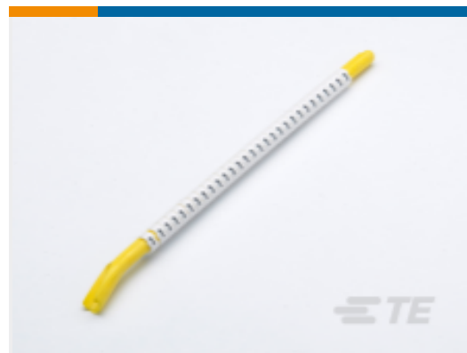
TE Part #5-1768042-6 STD Snap-On Markers