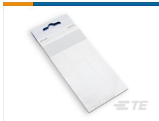
TE Part #5-1768016-1 BKM Self Laminating Vinyl Labels