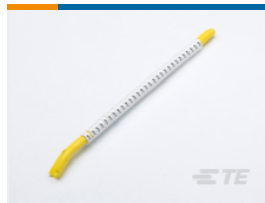
TE Part #2-1768045-5 STD Snap-On Markers