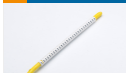
TE Part #369880-000 STD Snap-On Markers