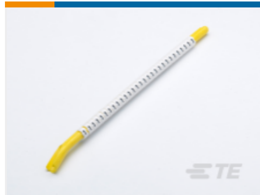
TE Part #403072-000 STD Snap-On Markers