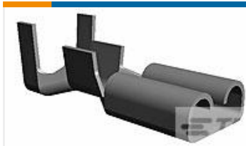
TE Part #61758-1 187 FASTON REC 20-16 AWG BR