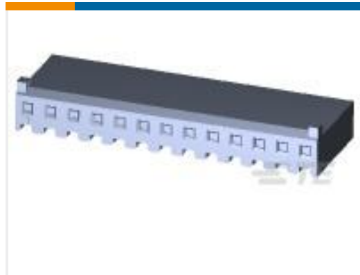
TE Part #1-770849-3 13P SL156 HSG W/LCK RMP & TABS