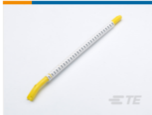
TE Part #403072-000 STD Snap-On Markers