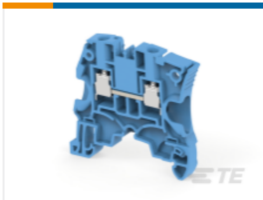
TE Part #1SNK506020R0000 ZS6-BL