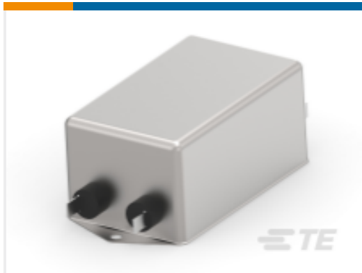
TE Part #2-6609037-6 12EP1=F8217