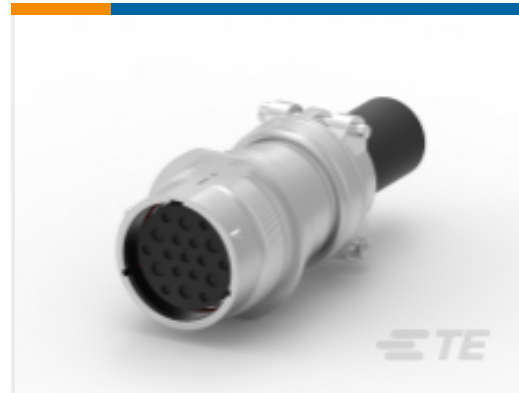
TE Part #HD34-24-19SE-059 REC,19P,AL,E,CBLCLMP BT,DRAIN,12 /16,S,MC