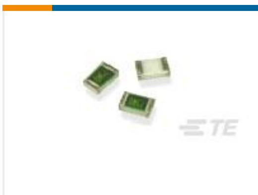
TE Part #2-2176094-6 RP 2A 0.25W 221K 0.1% 25PPM 1K RL