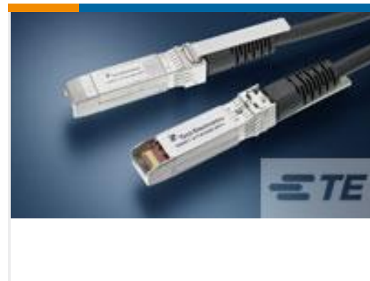
TE Part #1-2032757-1 C/A, ACTIVE SFP+ TO SFP+, T1 10M 28AWG