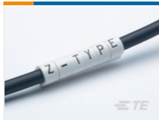
TE Part #EJ1952-000 06151412