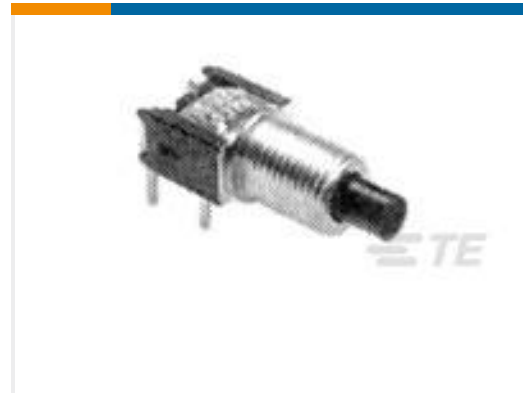
TE Part #1825100-4 TPF11CGRA004