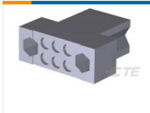
TE Part #202757-1 6 POS. FEM. BLOCK