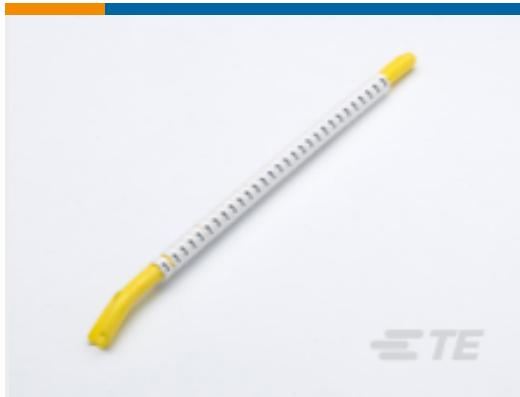
TE Part #1768045-1 STD Snap-On Markers