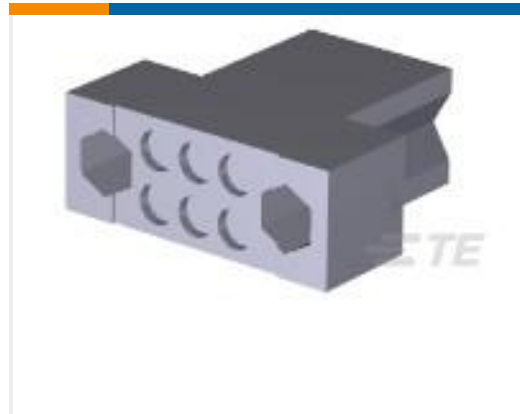
TE Part #202757-1 6 POS. FEM. BLOCK