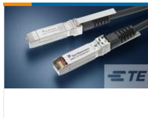
TE Part #1-2032757-1 C/A, ACTIVE SFP+ TO SFP+, T1 10M 28AWG