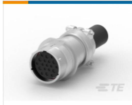
TE Part #HD34-24-19SE-059 REC,19P,AL,E,CBLCLMP BT,DRAIN,12 /16,S,MC