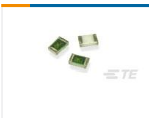
TE Part #2-2176094-6 RP 2A 0.25W 221K 0.1% 25PPM 1K RL