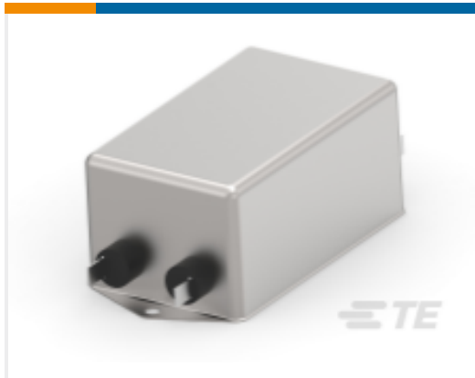
TE Part #2-6609037-6 12EP1=F8217