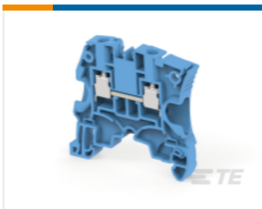
TE Part #1SNK506020R0000 ZS6-BL