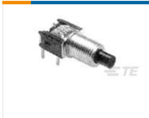
TE Part #1825100-4 TPF11CGRA004