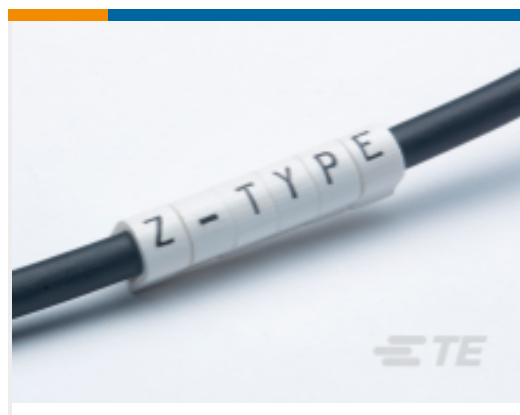
TE Part #EJ1952-000 06151412