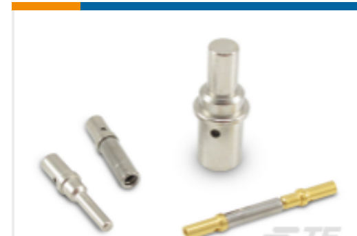
TE Part #0460-202-16141 DEUTSCH Solid Contacts