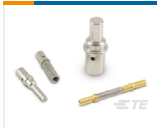
TE Part #0460-202-16141 DEUTSCH Solid Contacts