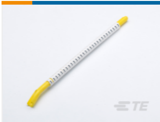
TE Part #3-1768043-4 STD Snap-On Markers