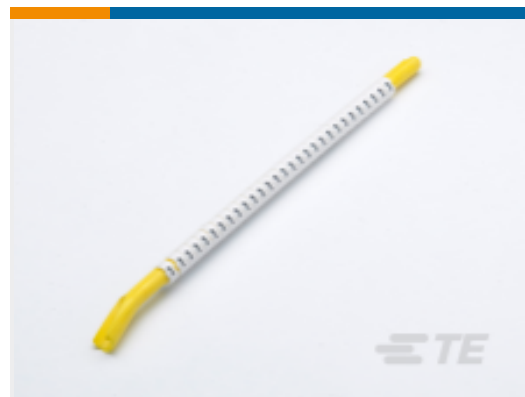
TE Part #345774-000 STD Snap-On Markers